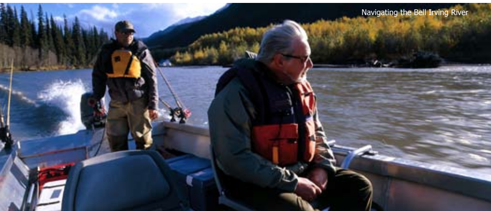
Navigating the Bell Irving River

When conditions are average a realistic expectation is to hook 2-4 fish per day averaging 12-15 lbs.